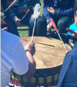
Registered Drummers and Dancers will be paid

Any student interested just needs to hand in the attached permission slip. The itinerary of events is below. Students will be excused from regular classes, board busses at 9am and return to school at around 3:00pm. All students,